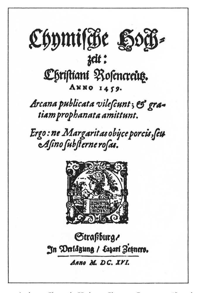
Ill. 2. Johann v. Andreae, Chymische Hochzeit: Christiani Rosencreütz (Strassbourg, 1616).